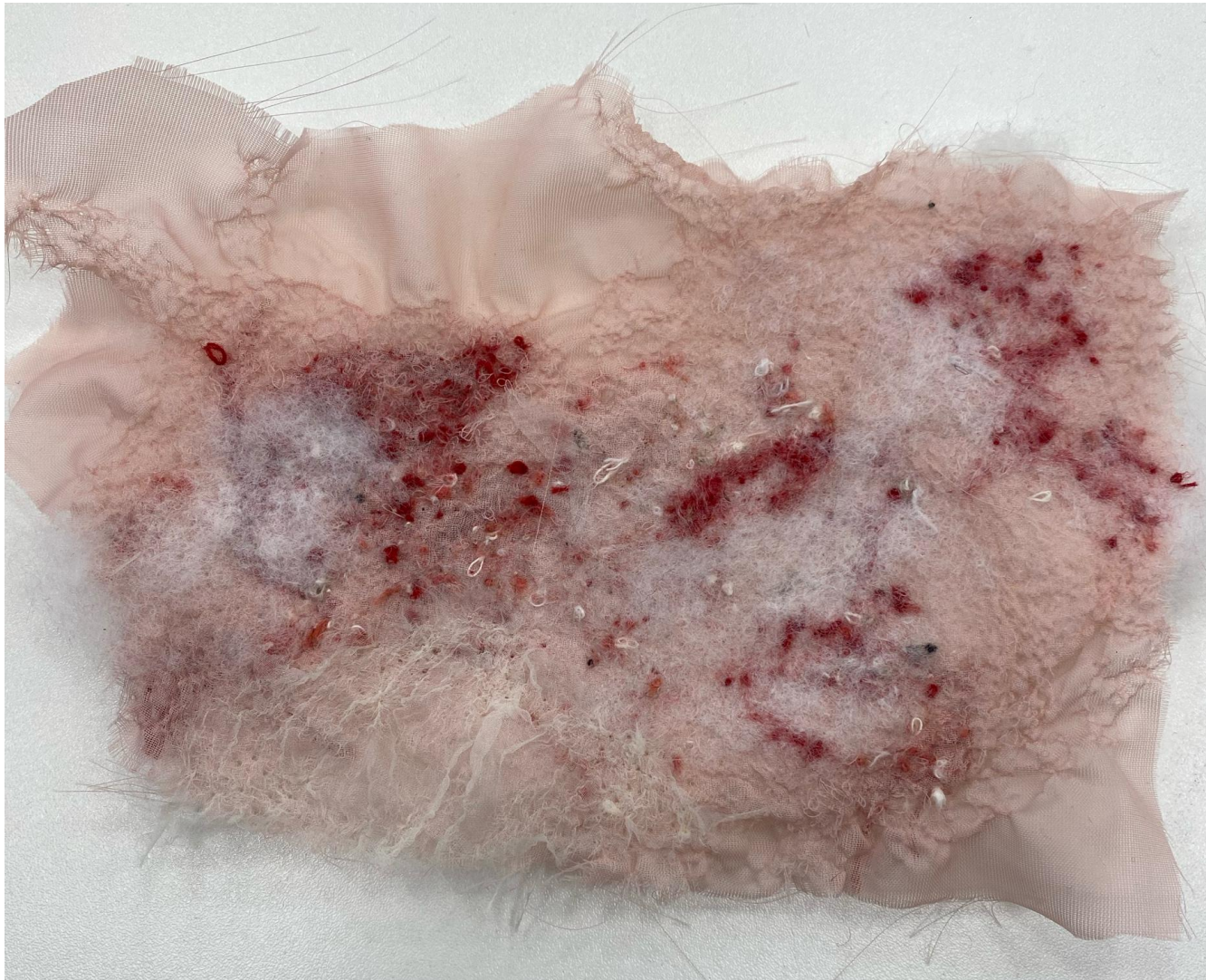
Untitled 2023 Polyester, acrylic yarn 20 x 12 cm